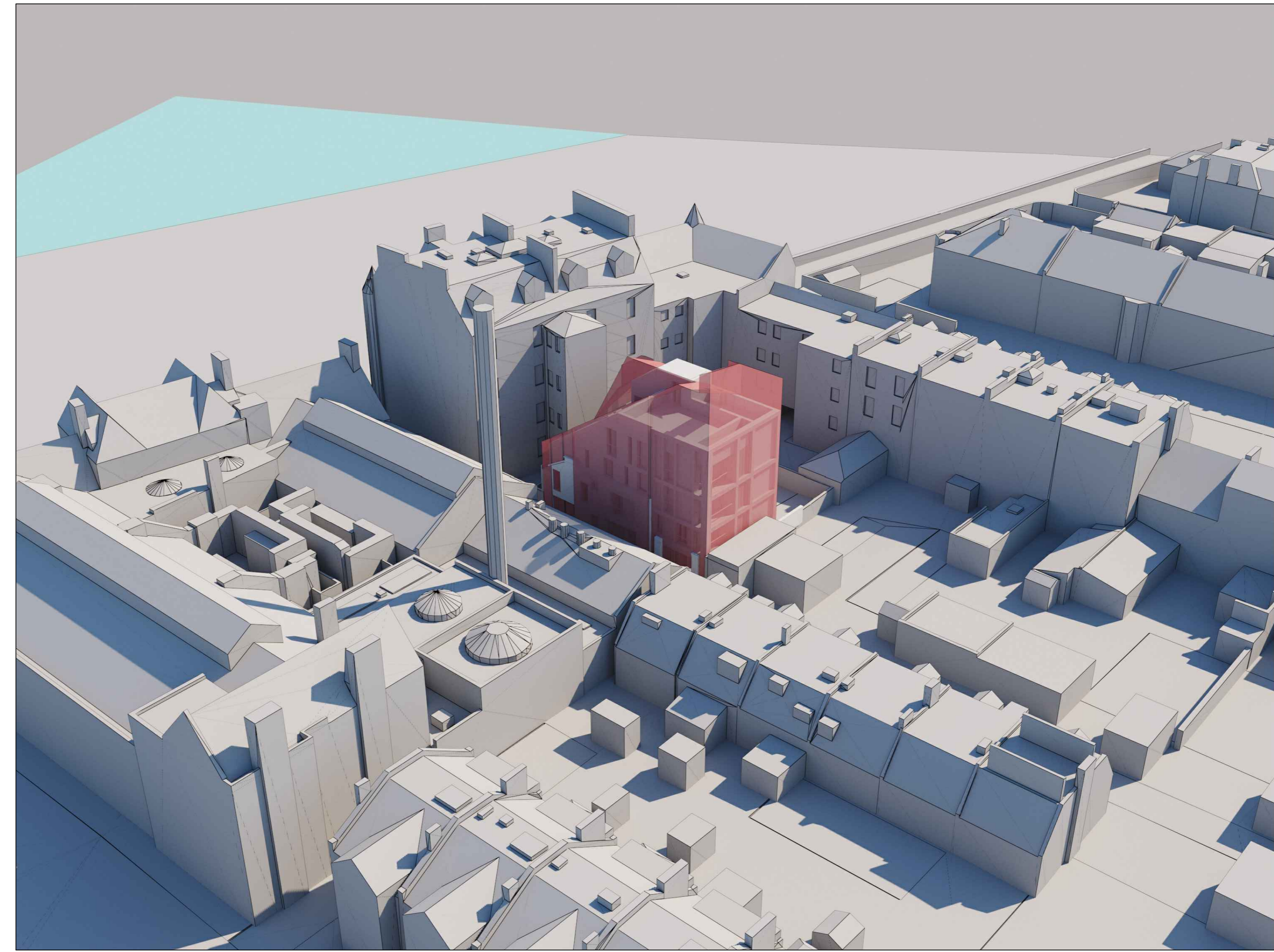
Proposed massing with superimposed model illustrating extent of protected daylight amenity to surrounding residential buildings.