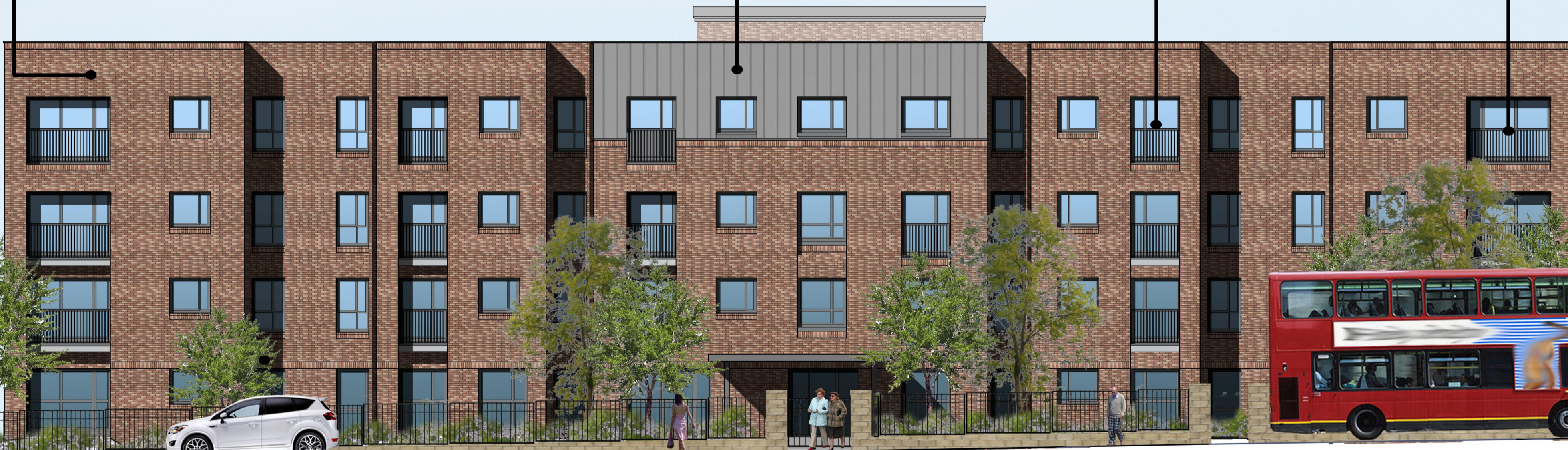
North East Elevation ( High Street)

ALL DIMENSIONS TO BE CHECKED ON SITE WORK TO FIGURED DIMENSIONS ONLY REPORT DISCREPANCIES TO THE ARCHITECT AT ONCE BEFORE PROCEEDING