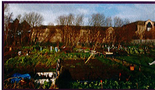
The allotments at nearby Baronscourt, similar to what is being proposed for Telferton