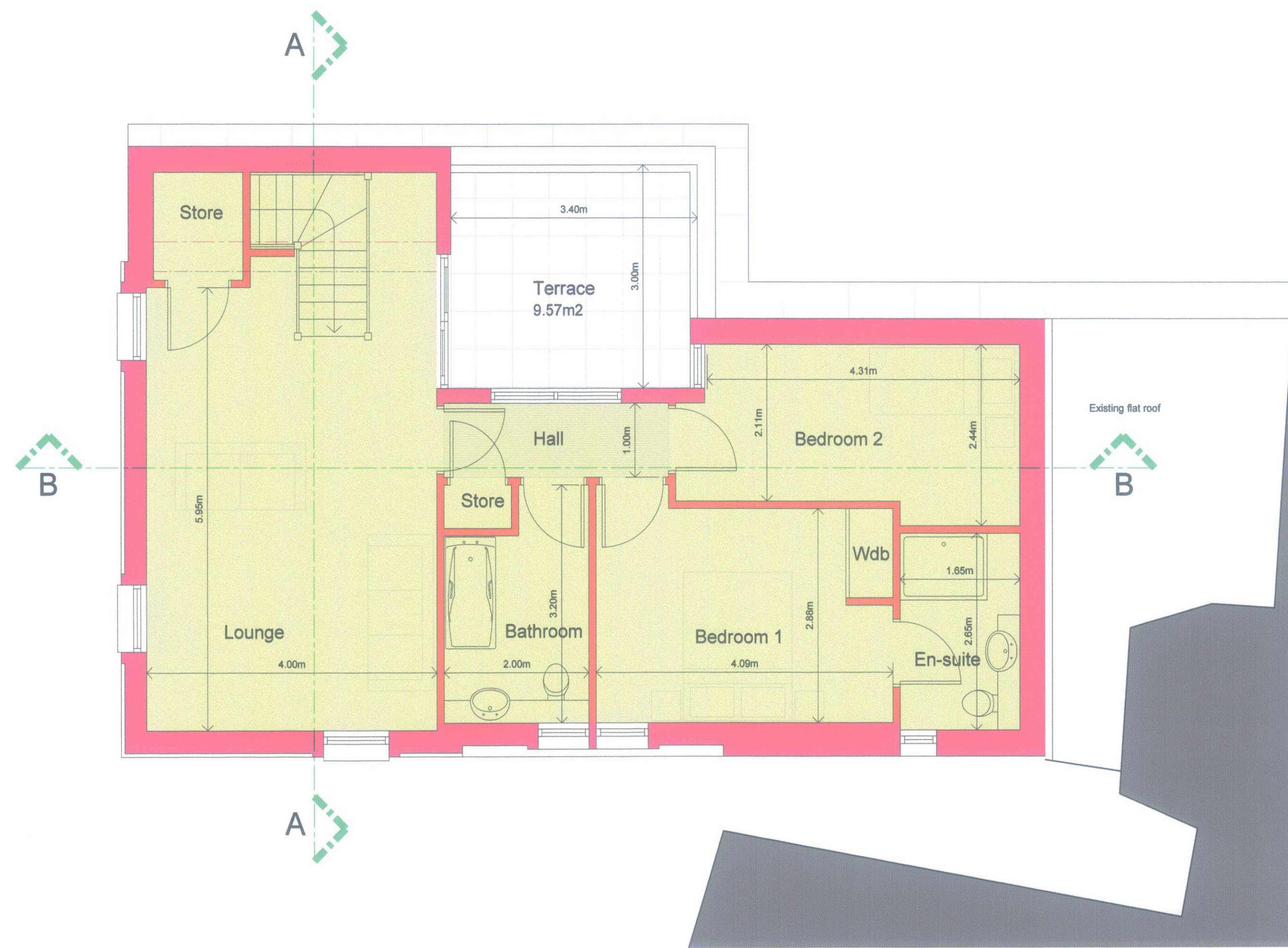
Proposed First Floor Plan 1:50 67.93m2