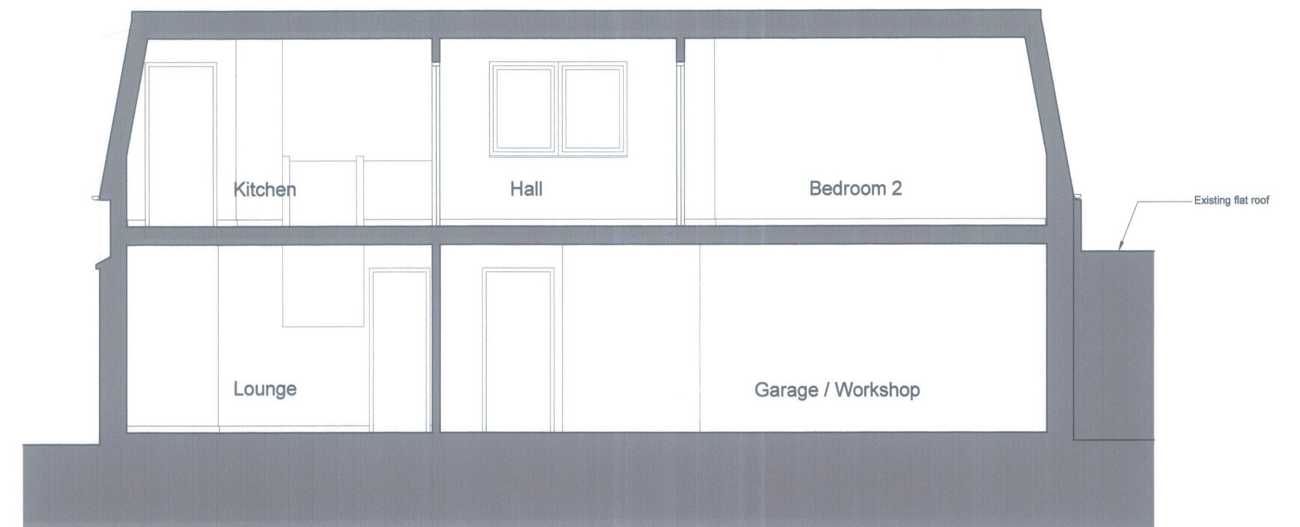
Proposed Section BB 1:50